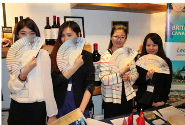
BC/Shanghai Alumni Evening in Jing'an District, Shanghai