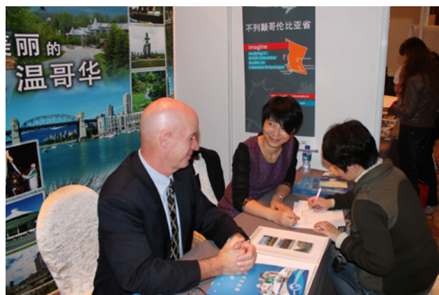
BC schools, school districts and institutions participated in the China Education Expo 2013 in Chengdu