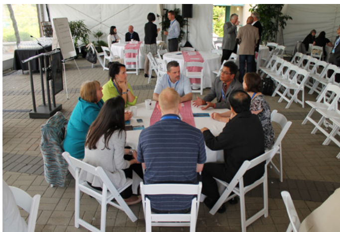
Summer Seminar, BCCIE's annual professional development conference, brings together over 250 participants from our province and around the world.

Each year BCCIE coordinates the following activities: at least ten professional development and speaker series events, two to three international missions, two to three signature conference events, six incoming delegations and two incoming familiarization tours for educators and students from abroad. In addition, BCCIE sends out an average of 24 bulletins and newsletters, processes over 100 new and renewal Education Quality Assurance (EQA) applications, and maintains its three websites (BCCIE primary, EQA and StudyinBC).